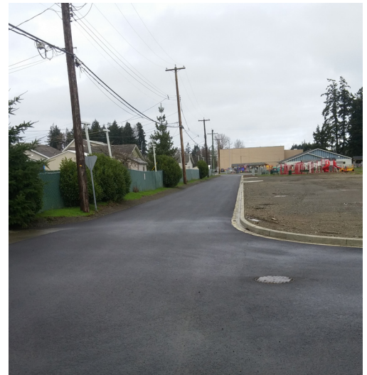
Newly paved road at Hardhack St. & Roas Ave.