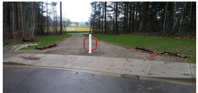
Right-of-way at DND sports Field and Oceanspray Rd.