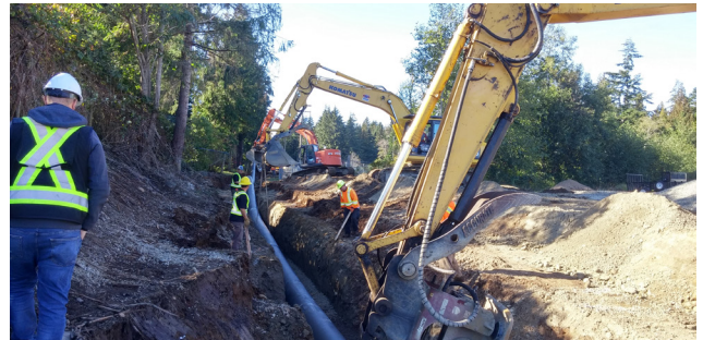
Crews lay a portion of sewer pipe for the new forcemain

With work now complete, we'd like to thank everyone affected for their continued patience over the last six months. With the community's support, this project was finished on-time and on-budget. Making these updates to the system has prepared us for the future and for ongoing residential growth in our region.