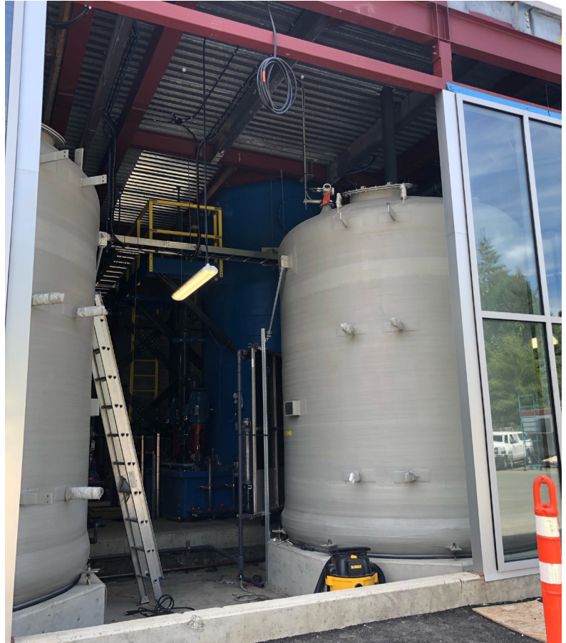
The scrubber ‘cleans’ odourous air before it is released via a stack (chimney). A second scrubber was added as part of the odour control upgrades to treat bioreactor air and is now in operation.