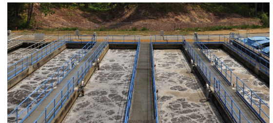
The bioreactors will be fully covered next year.

To stay informed on the upgrade work, watch for updates at www.comoxvalleyrd.ca/sewagetreatment