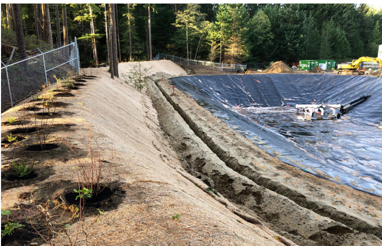
New EQ basin undergoing testing.

With construction of the EQ basin complete, the team will continue upgrade work on related infrastructure, which involves replacing process piping in the basement of the plant. This final work is planned to be complete by Spring 2020.