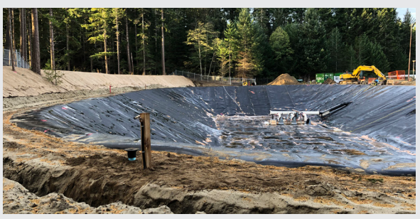
Installation of new EQ basin is nearing completion.

Watch for updates at www.comoxvalleyrd.ca/sewagetreatment