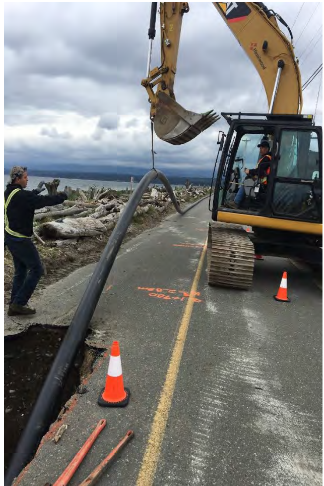
Installation of sanitary forcemain using directional drilling method.

Project updates will be shared at the webpage as construction begins again in September. Please email the above address if you would like to be added to an email notification list.