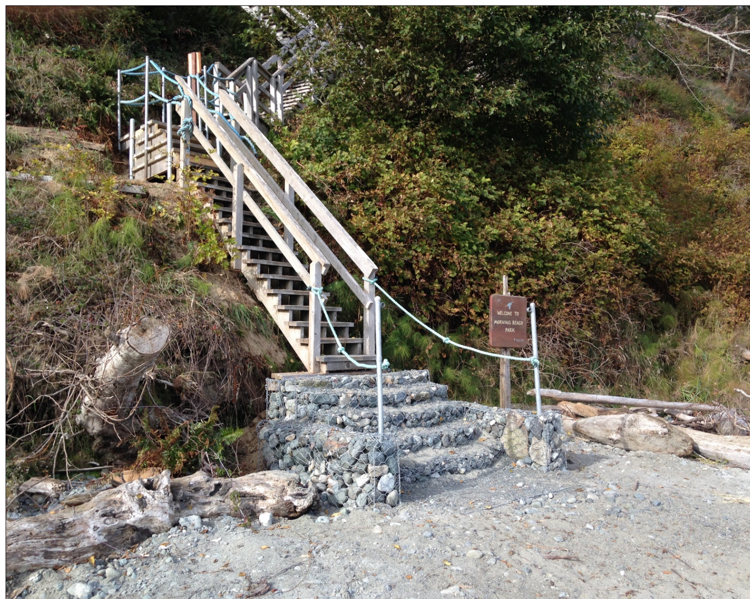
Morning Beach Park – New wire gabion stairs to access foreshore

In October 2018 re-alignment of the bottom portion of the Morning Beach Stairs had to be undertaken to address slope erosion occurring along the Komas Bluffs. The bottom staircase was moved approx. 30 meters along the toe of the slope and attached to the main staircase. A set of stairs were installed, created by linking wire gabion baskets filled with cobbles together, to make up the difference in height and protect the stairs from the powerful winter storm surges.