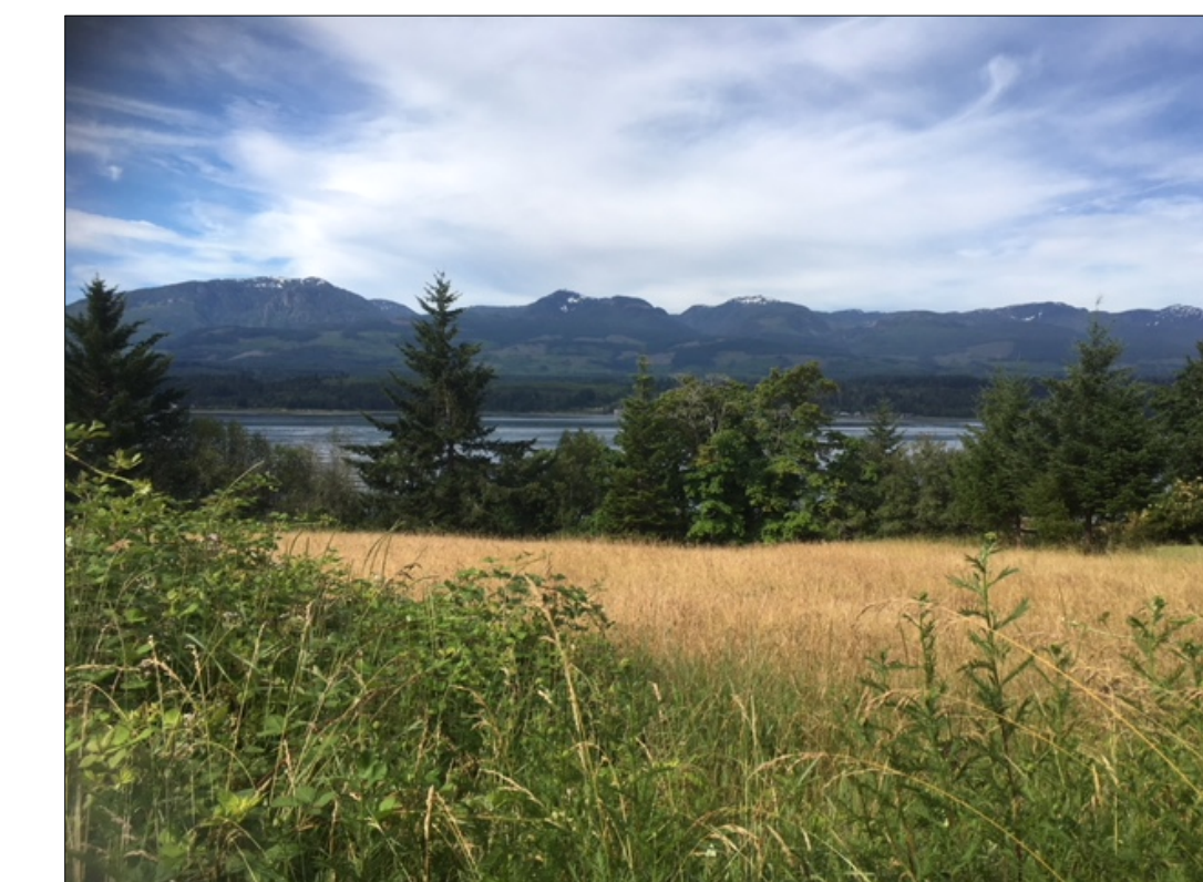
View of beach access from Piercy Road towards Vancouver Island