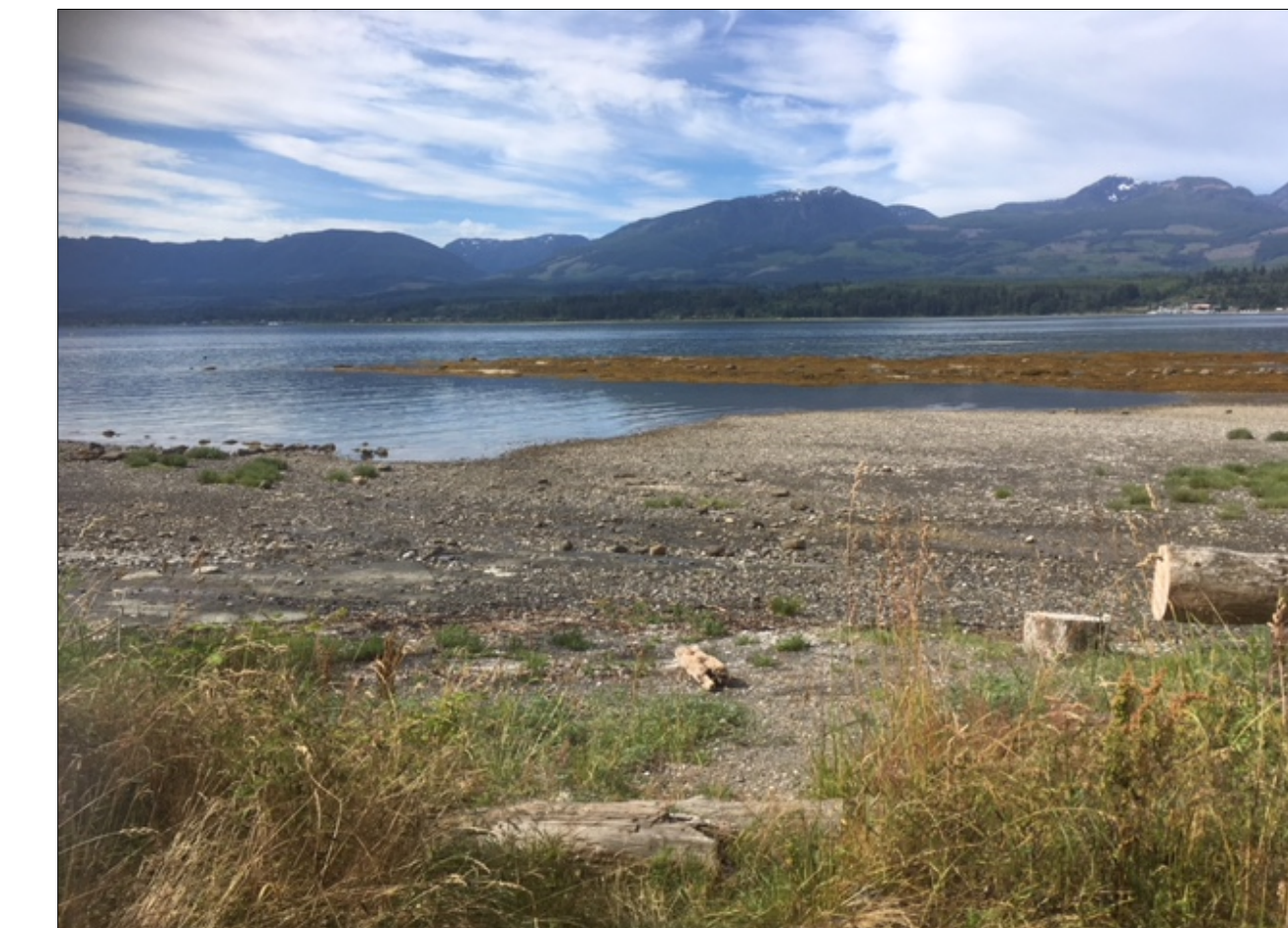
Beach in front of Piercy Road beach access

In summer of 2019 the CVRD was granted a License of Occupation from the Ministry of Transportation and Infrastructure over the Piercy Road Beach Access. Steps can now be taken to budget for and implement amenities within the new Piercy Park.