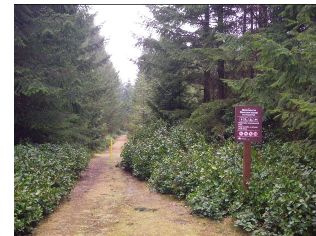
SRW secures public access to east side of provincial park