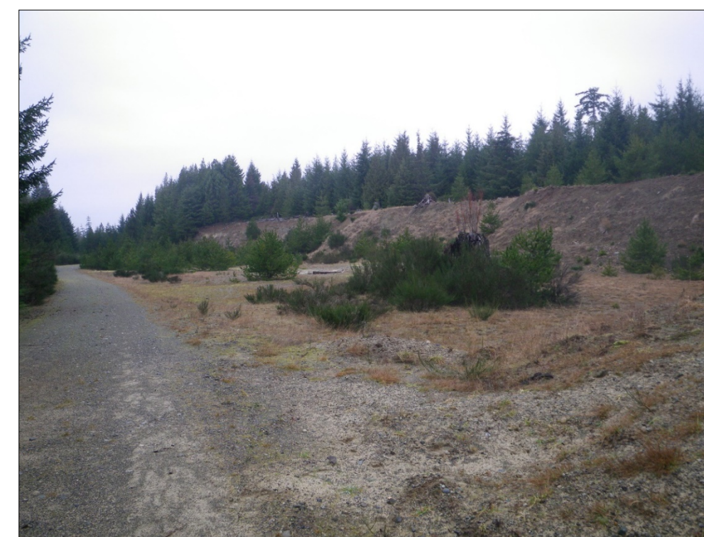
Trail follows road adjacent to old gravel pit