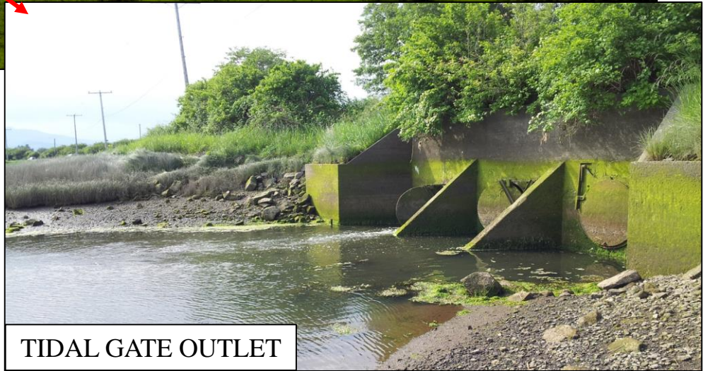
TIDAL GATE OUTLET