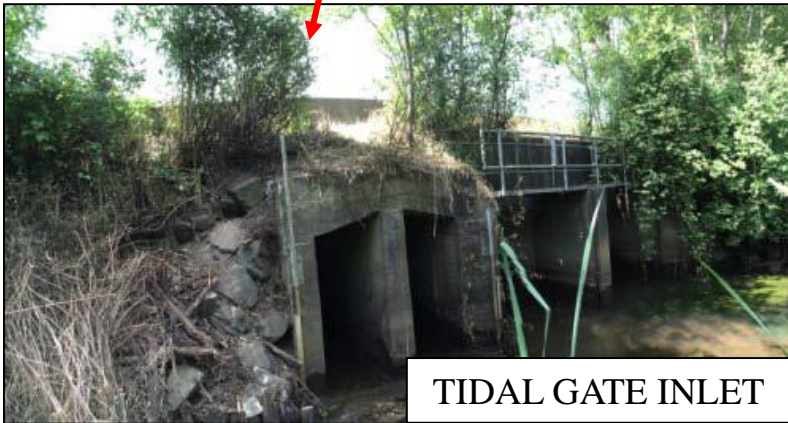
TIDAL GATE INLET