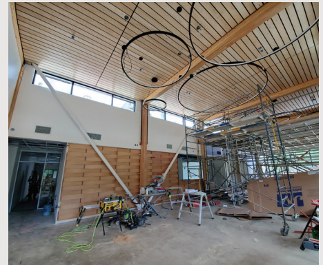
Finishing work on the public lobby of the treatment plant is underway