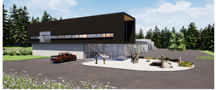
Operations centre entry view