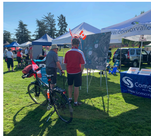
Visitors checking out a map of the new water treatment system at Canada Day in Lewis Park.

Thanks to all for coming out to learn more about the project at community events this summer. We connected with many local residents and had great conversations about the system and plans. Stay tuned for details on a public open house planned for the new year.