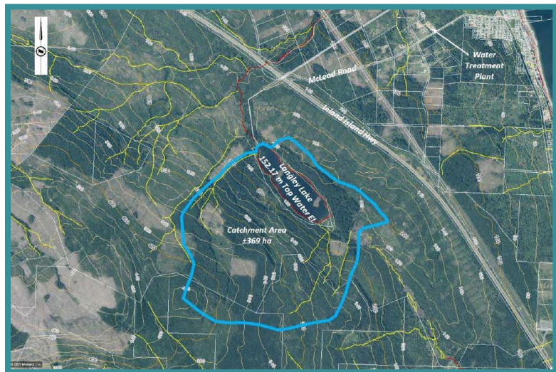
Langley Lake watershed.

The lake watershed is 369 hectares of drainage basin and is much of it is privately owned and managed for timber supply.