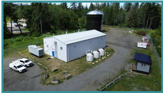
Union Bay Water Treatment Plant

After disinfection, the water enters McLeod Reservoir which provides contact time for the sodium hypochlorite to disinfect any remaining bacteria.