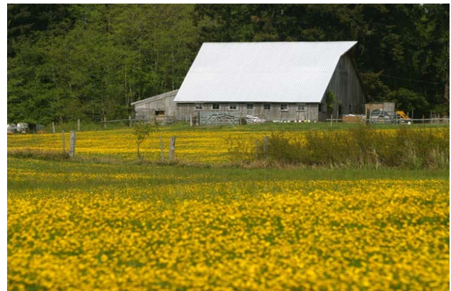
Puntledge, Black Creek (Area C)

Despite the challenges, Holland believes the framework exists to ensure a satisfactory strategy emerges from the discussions. The first public consultation as part of the sustainability process was held October 2, and when the process wraps up in a year the draft document will go to the municipalities for comment.